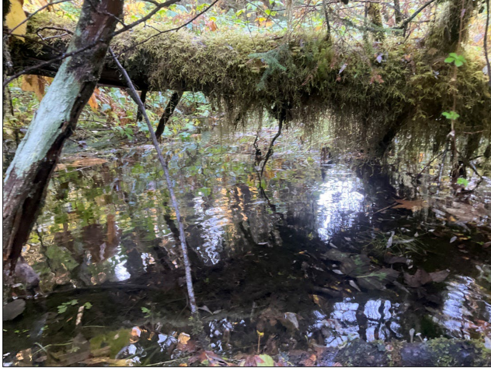
Figure 2.–Channel downstream of the road.