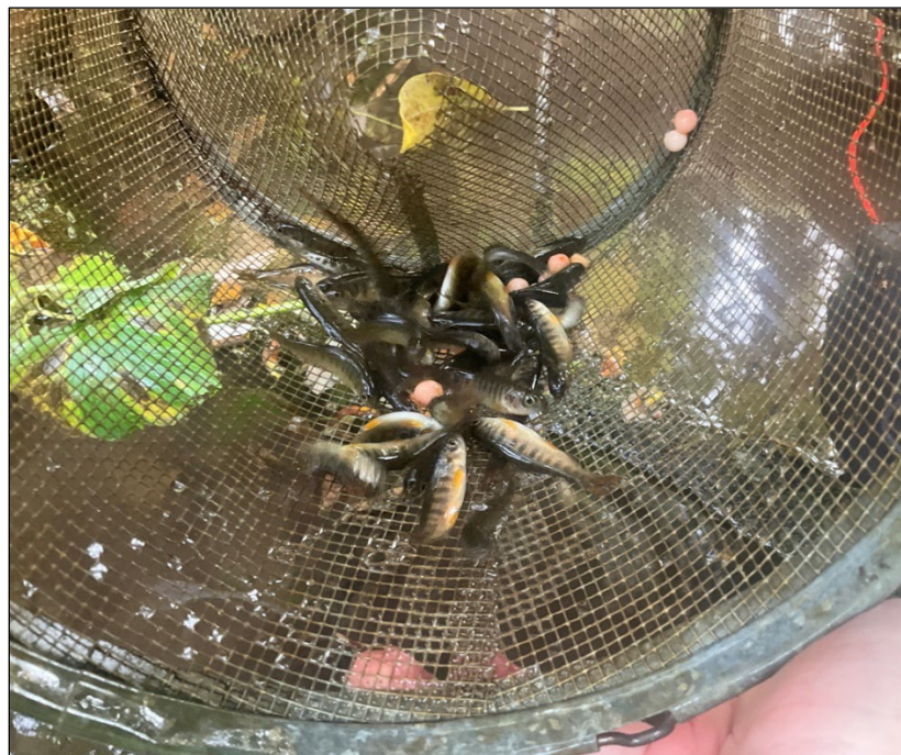
Figure 1.–Juvenile coho salmon and Dolly Varden captured at waypoint 1224.