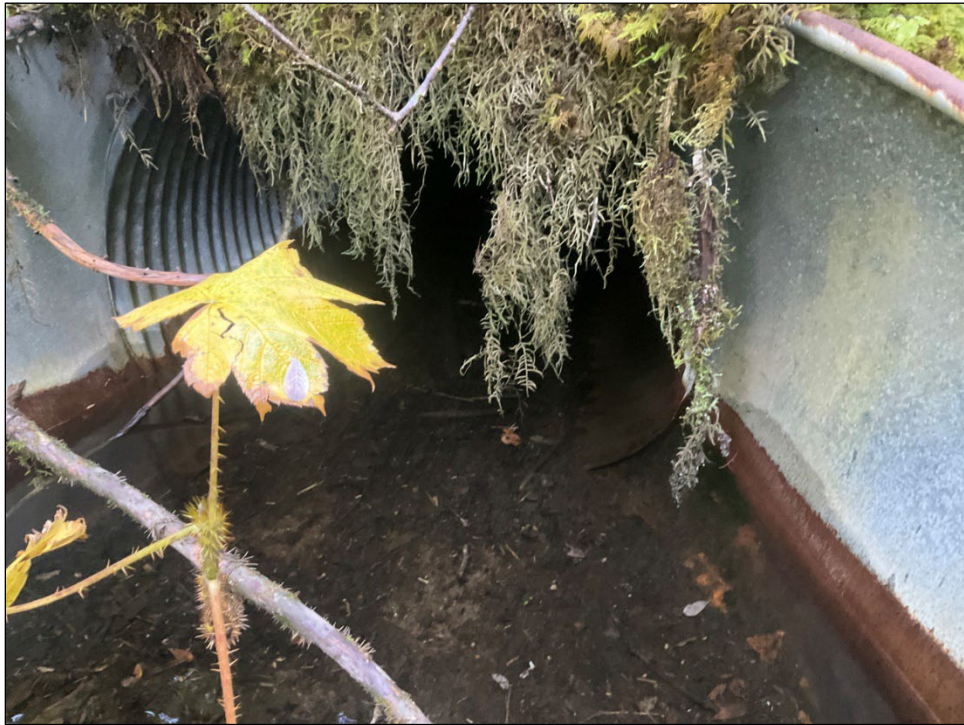
Figure 3.–Culvert downstream of the road.